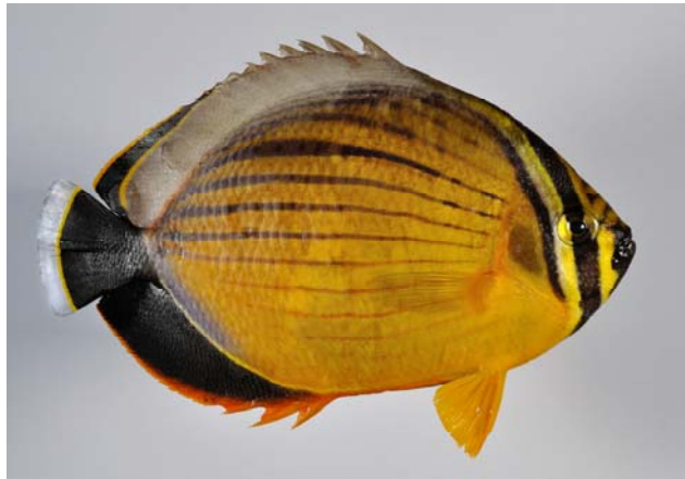
Chaetodon austriacus (TAU – P. 14384).